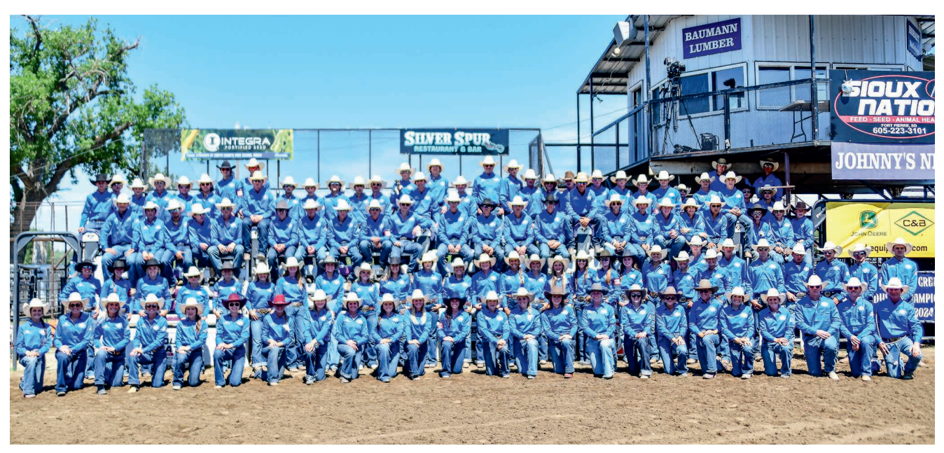
Finalists wear Touchstone Energy Short Go shirts.

"I don't know how to explain it," Sander said. "It's super scary before you start, but once you climb into that chute and they open up the gate, it's like eating your favorite cake."