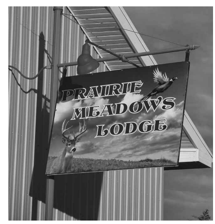
Prairie Meadow's Lodge welcomes pheasant hunters from across the nation.

"We planted a few food plots this year with a 'pheasant mix,'" said Schecher. "The mix includes