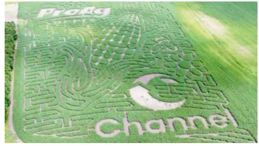
A bird's-eye view of last year's Back Forty Beef corn maze.

This fall, Clint and Kelly are again inviting their surrounding communities to visit their homestead and explore this year's newly designed maze. The maze is set to be open to the public every weekend after