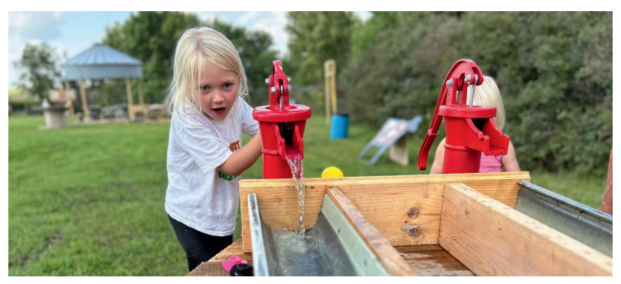
Back Forty Beef hosts a number of family-friendly events including duck races.

transformed their operation into a direct-to-consumer agriculture business, launching Back Forty Beef, LLC. Their new venture allowed them to provide locally raised beef at a fair price while giving customers the opportunity to see